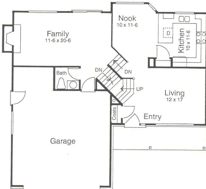
Main Floor Plan 832 sq. ft. (Approximate room size)